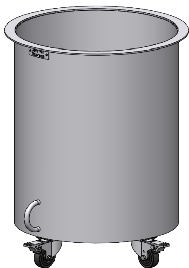
500dia x 600h mm Weight 8 kg