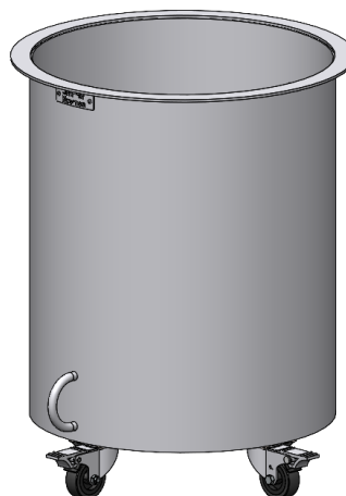
400dia x 500h mm Weight 5 kg